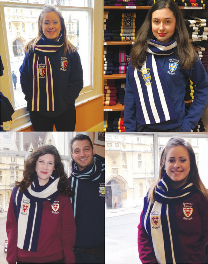
College Scarves + Hoodies